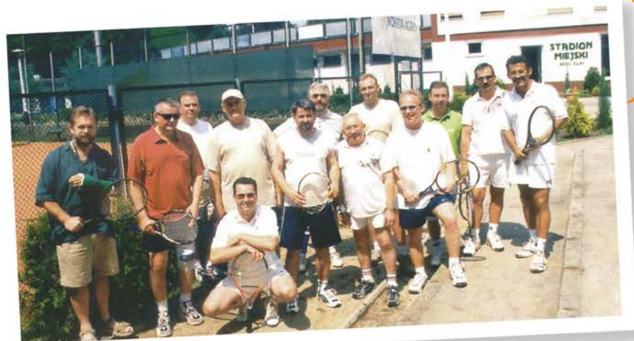
2003: Chemist's Day – tennis tournament