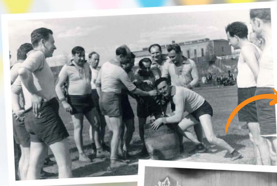
1967: Chemist's Day – barrel of beer going to winners of the game at the old stadium. The electrolyser hall in the background. (FB_JauCzykiel)