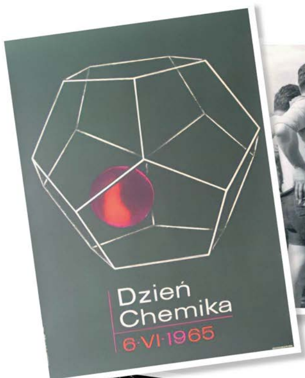
Table of Contents/June 2021