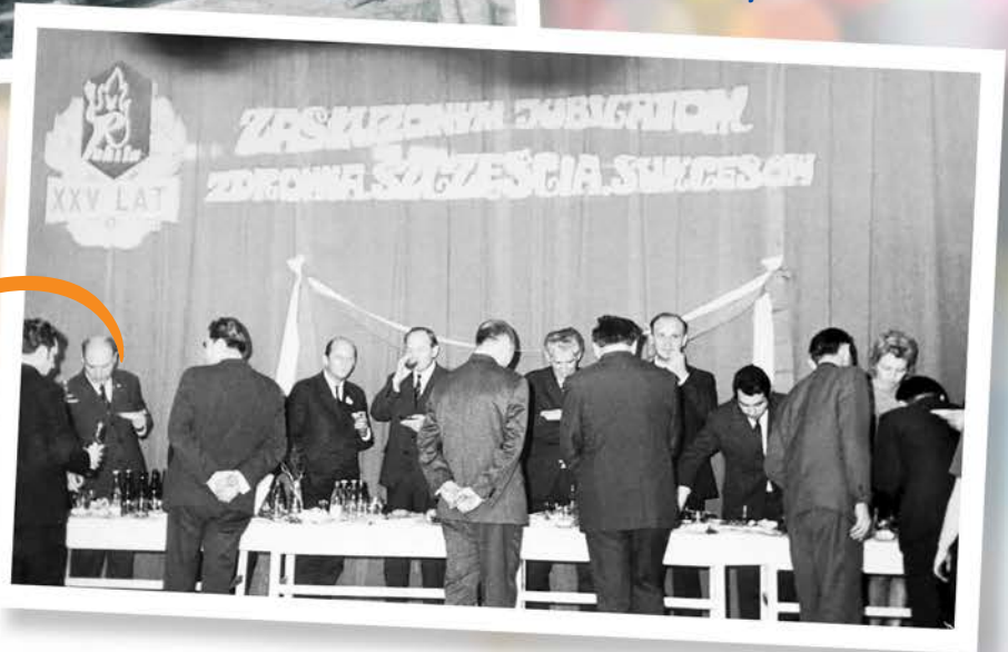
1971: 25 years of NZPO for jubilee celebrators

attractions for children on the occasion of Children's Day.