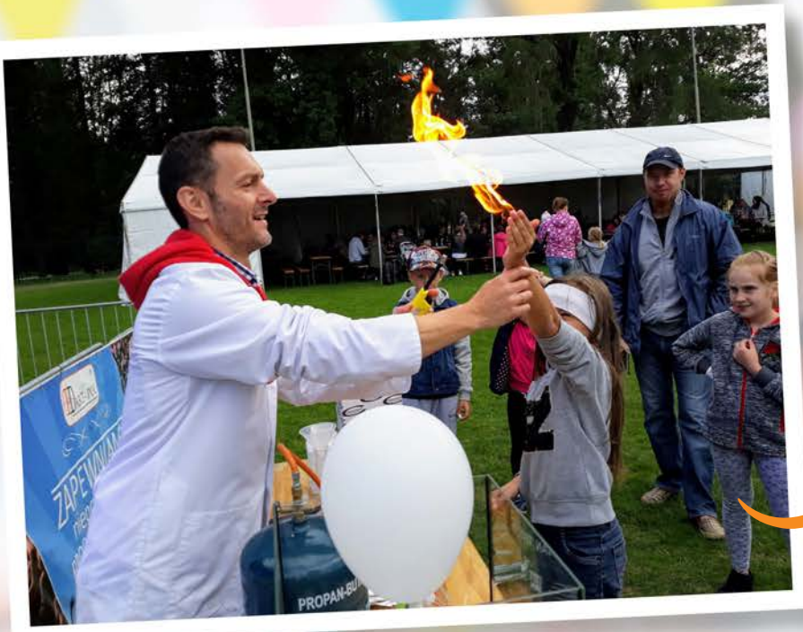
2018: Fire magic show!

to be able to be here today on this momentous occasion – the moment of honouring your efforts with a symbolic, yet very meaningful badge, whose value is certainly not simply material.” Beautiful words, both worth repeating and constituting an excellent cheat sheet for the next CEOs.