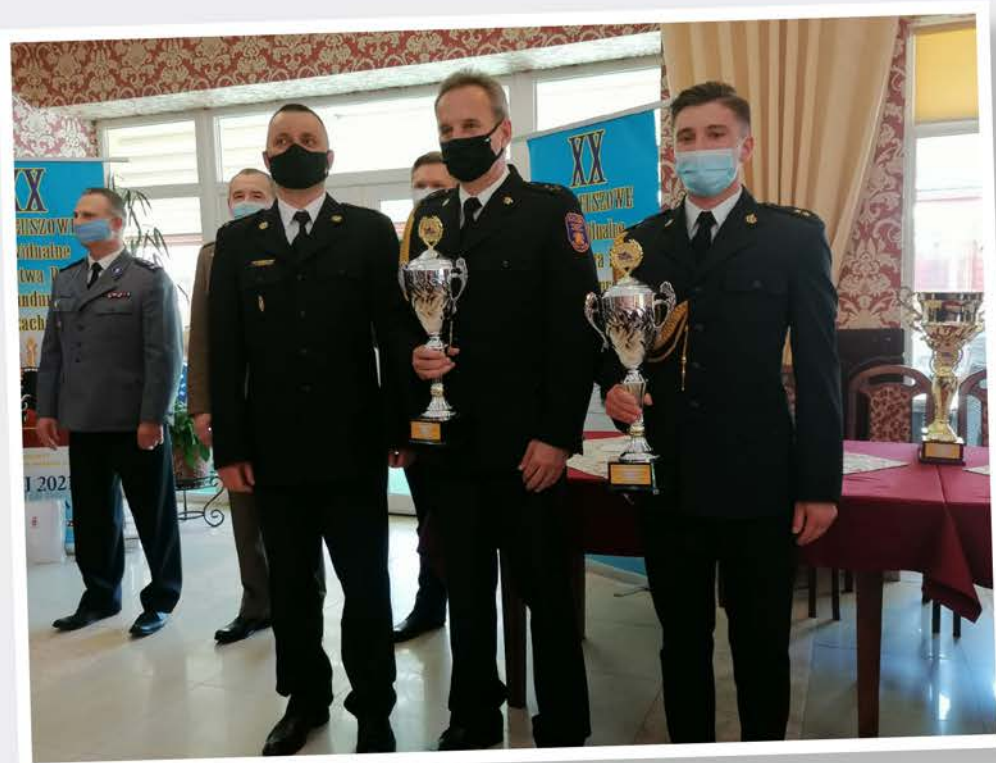
XX Individual Polish Championship of Uniformed Services

years ago, and in total I've taken part in these tournaments a dozen or so times.