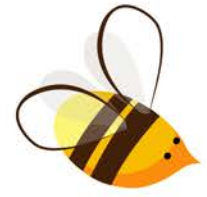
Kacper (Lukasz Salomonowicz)

The activity of sowing flower meadows was also joined in by little helpers from PCC Intermodal, who worked briskly and very professionally. Sand shovels, watering cans and rakes were all quickly in use... all so that the colourful flowers could soon be enjoyed. We're waiting for the results!